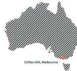
Clifton Hill, Melbourne

Two views of the remarkable ebony veneer applied to the living space. Left: perspective from the living room. Right: north from the dining room.